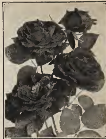
Cl. Gruss an Teplitz